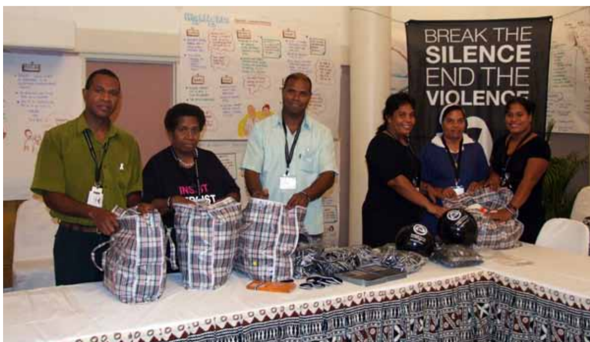
Kiribati and Vanuatu receive their White Ribbon Day packs.